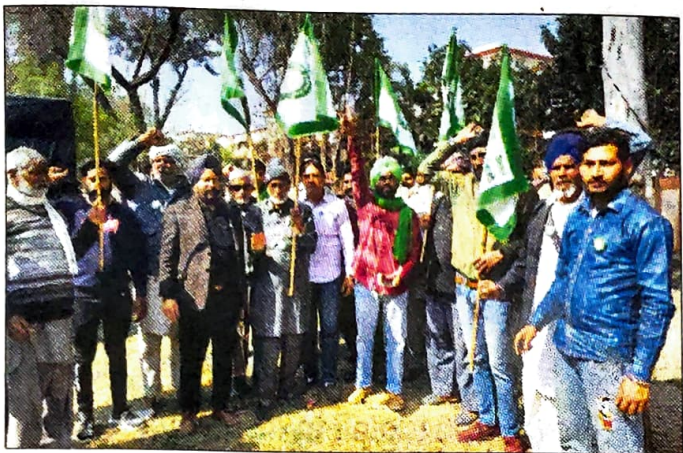
Farmers hold a protest in Ferozepur on Wednesday.