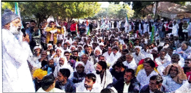
Farmers stage a protest outside the Mini Secretariat in Hisar.

Earlier, farmers, hailing from 17 villages, under the banner of farmers' organisations Samyukta Kisan Morcha, Pagri Sambhal Jatta, Bhartiya Kisan Union (Bhagat Singh) and Bhartiya Kisan Mazdoor Union, staged a protest at the Mini