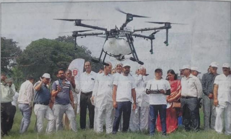
A drone being launched by the MHU in Karnal on Thursday.