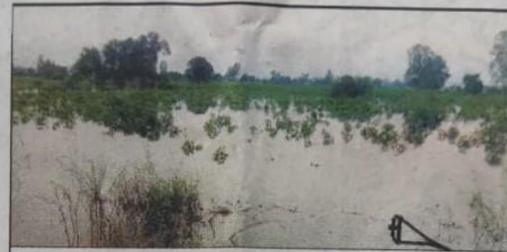
Fields in Kheri village of Uklana, Hisar district, are still waterlogged after heavy rainfall a few days ago.

The officials of the department said Uklana, Barwana and Narnaund blocks were the worst-hit as fields in