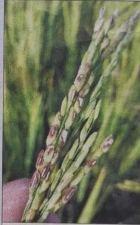
Discoloured grains of the paddy.