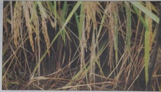
Standing crop damaged in a field in Karnal on Saturday.

KARNAL, SEPTEMBER 24 Heavy rainfall for the past five days is giving sleepless nights to farmers in Karnal and Kaithal districts as it has caused 'extensive' damage to their standing paddy crop. The farmers are keeping their fingers crossed as the rain has caused waterlogging in the fields where the crop is ready for harvest.