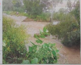
A canal breaches due to excessive rain and inundates fields in Rohnat village of Bhiwani district.

The heavy rain has led to the overflowing of the canal due a breach in it near Rohnat village in Bhiwani district. This has inundated the standing crops in several acres. The villagers said a breach had occurred in the Sunder branch, which inundated nearly 300 acres. A senior agriculture official said the rain would damage the crops that were in the harvesting stage. TNS