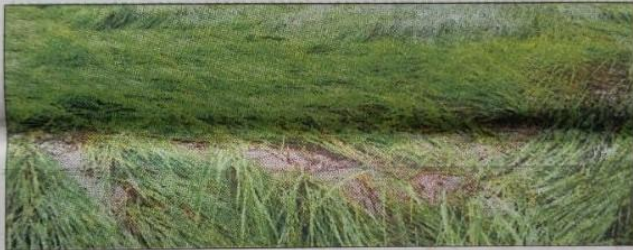
Paddy flattened in a field in Sonapat district.

Continual rain in the region increased the worry of farmers in Panipat and Sonapat. Farmers are worried a lot as the paddy crop in these two districts is in the flowering stage. Farmers said if the rain continued for long, their standing crop would be damaged. In Gohana, Mundlana and Kathura blocks, fields were waterlogged and standing paddy crop had flattened. "If rain continues for a few more days, it will damage the paddy in the region. Most of the paddy in the region is sown late and it is in the flow-