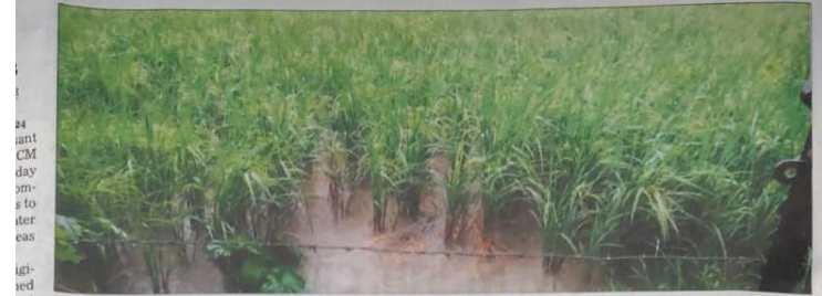
A waterlogged paddy field at a village in Palwal district.