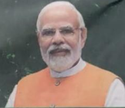
Narendra Modi, Prime Minister

"For ages, conservation of wildlife and habitats has been a part of the cultural ethos of India, which encourages compassion and co-existence"