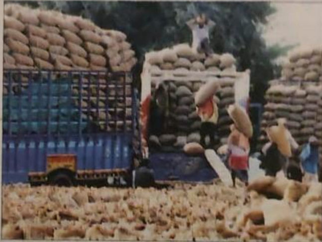
Paddy being loaded on trucks at the grain market in Karnal. SWEED AHMED

The sources said several vehicles, including canters, loaded with paddy in gunny bags, were brought from neighbouring states and sold in different mandis on the name of farmers from various districts of the state. The authorities gave reasons that