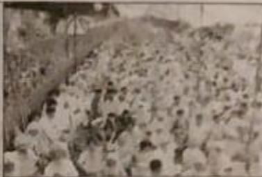
Farmers protest near the CM's residence in Sangrur. FILE

bonus to manage the stubble. Besides financial aid, farmers are also demanding machines in each village. Farmers said only a few of them had got machines to date.