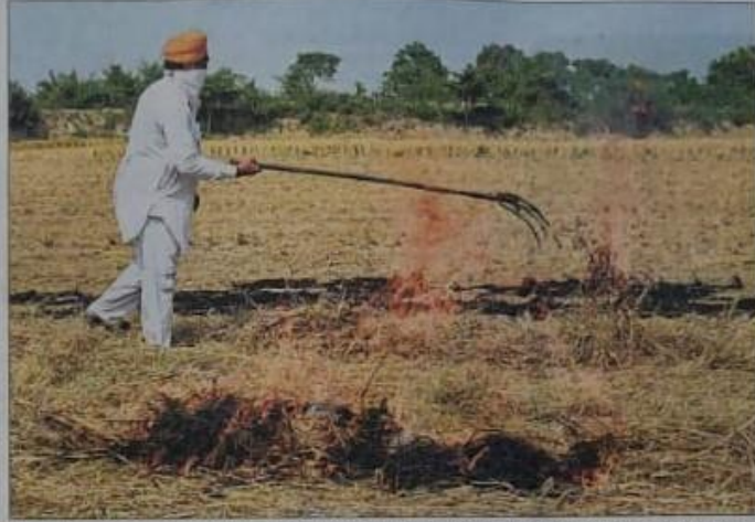
Punjab has reported nearly three-fold jump in farm fire incidents in the last nine days, with 2,625 cases so far this season.