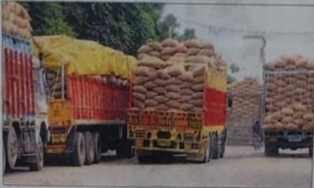
PUSA-1509 and PB-1121 are fetching ₹4,500 in Haryana, FILE