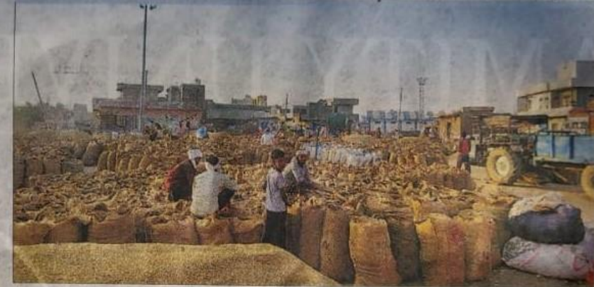
Farmers manage the paddy varieties at the Hodal grain market of Palwal district