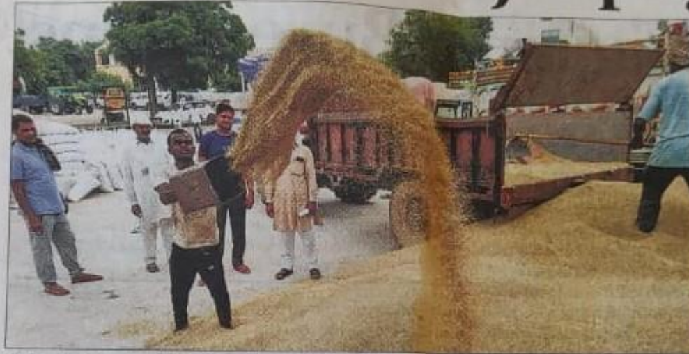
A labourer manages bajra at a grain market in Jhajjar.

More than 11,000 farmers in the four districts have sold their bajra to HAFED, a government agency, this season at rates ranging from Rs 1,900 to Rs 1,950 per quintal while the Centre had announced Rs 2,350 per quintal as the minimum support price (MSP). However, the state government has announced to pay Rs 450 per quintal to